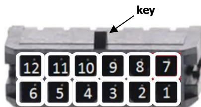
Figure 2. MT-865 ONE Interface Connector

Scheme of the interface connector (view from the side of the tracker contacts) (Figure 2):